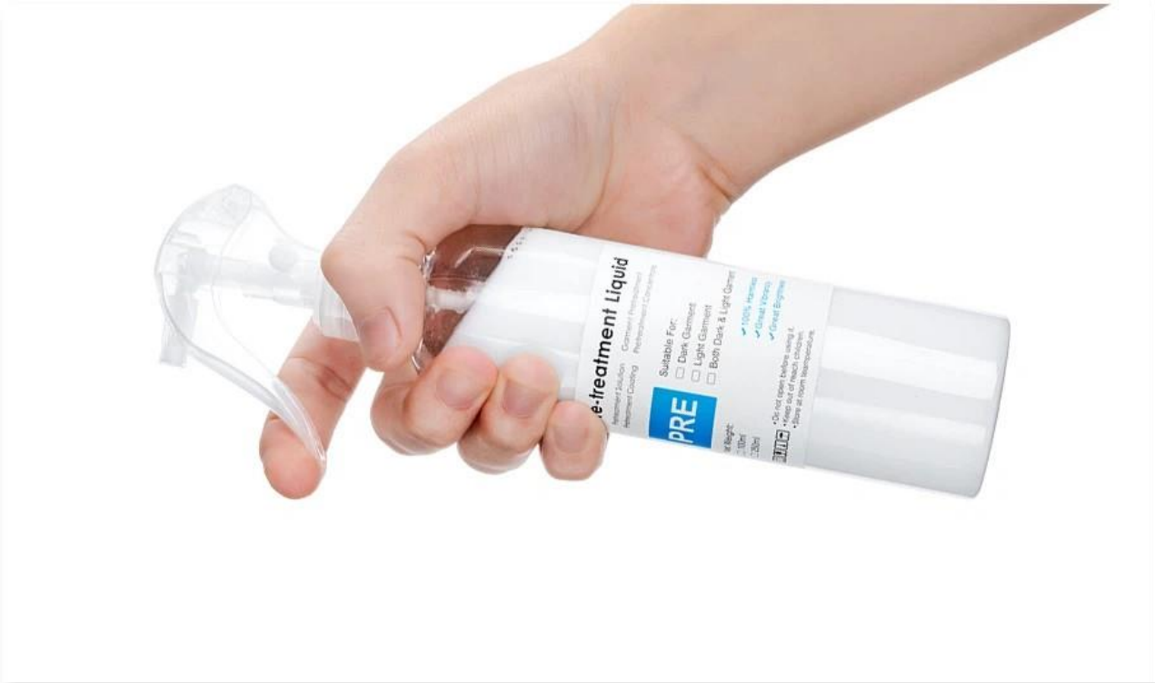
The Safety Buckle Design On The Bottle Makes It Simple To Push, Prevents Liquid Leaking, And Makes It Difficult To Obstruct The Nozzle.