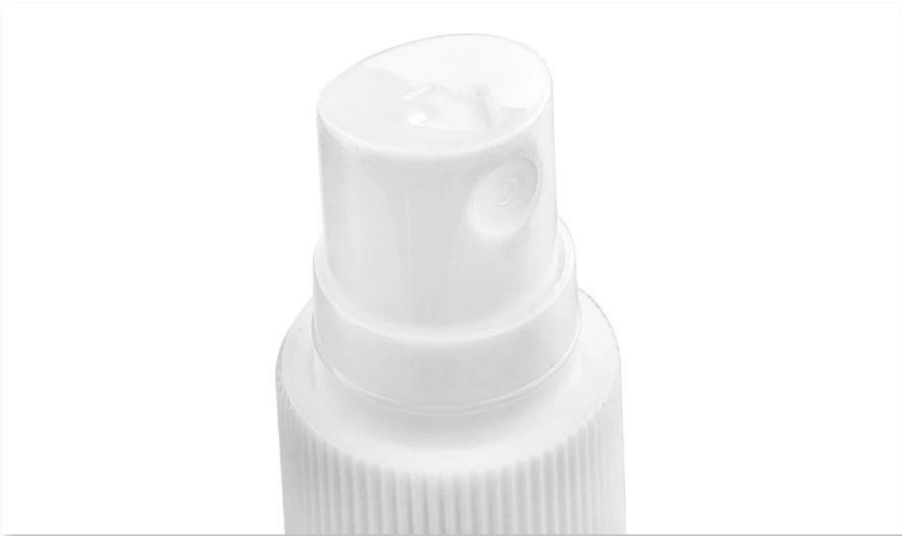
DTG Pretreatment - 250ML

The Spray Bottle's Shape Makes It Simple To Push And Diffcult To Obstruct The Nozzle, Allowing For Uniform Application Of The Pretreatment To The Cloth.